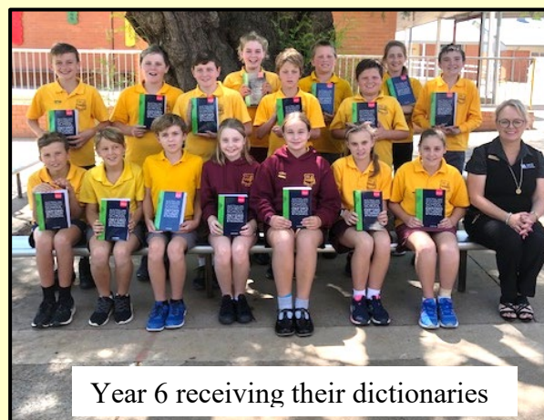
Year 6 receiving their dictionaries

Visit our website: www.barooga-p.schools.nsw.edu.au