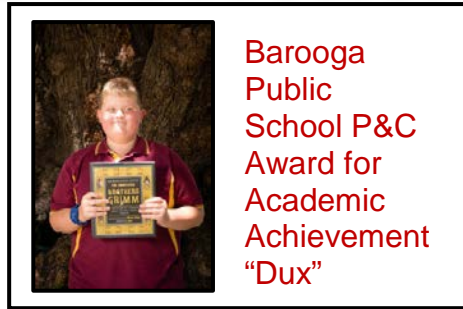
Barooga Public School P&C Award for Academic Achievement "Dux"