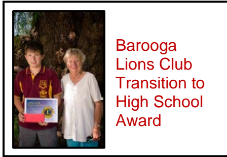
Barooga Lions Club Transition to High School Award